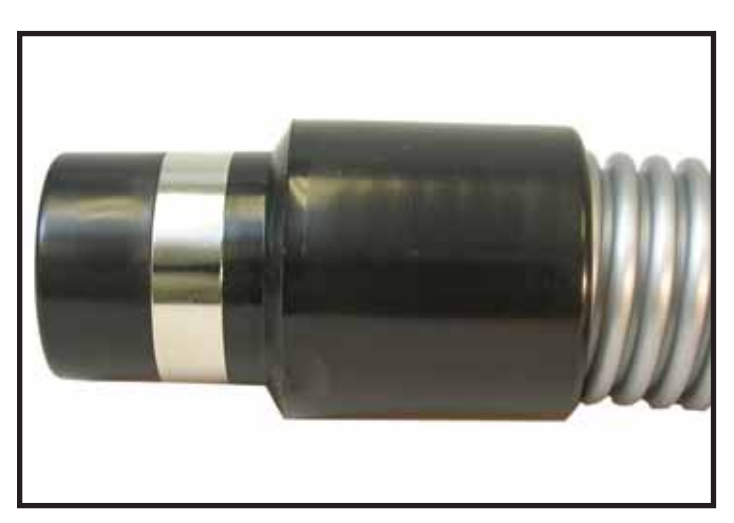
V222 Old Style Cuff

To identify the old and new hose cuffs, see the photos below.